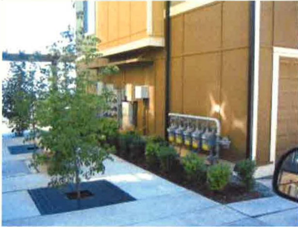
Utilities Consolidated and Separated by Landscaping Elements

1. Equipment shall be located and designed to minimize its visibility to the public. Preferred locations are off alleys; service drives; within, atop, or under buildings; or other locations away from the street. Equipment shall not intrude into required pedestrian areas.