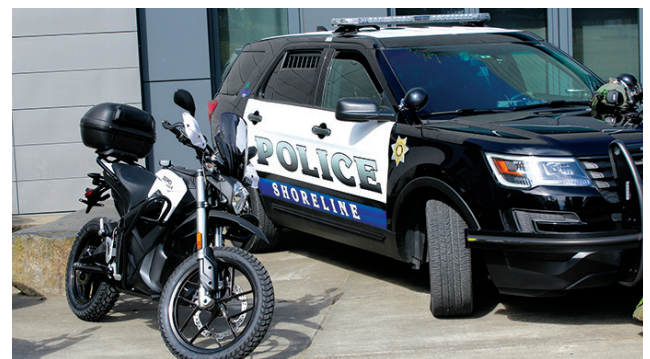
Police Services Report