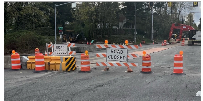
145th Corridor construction