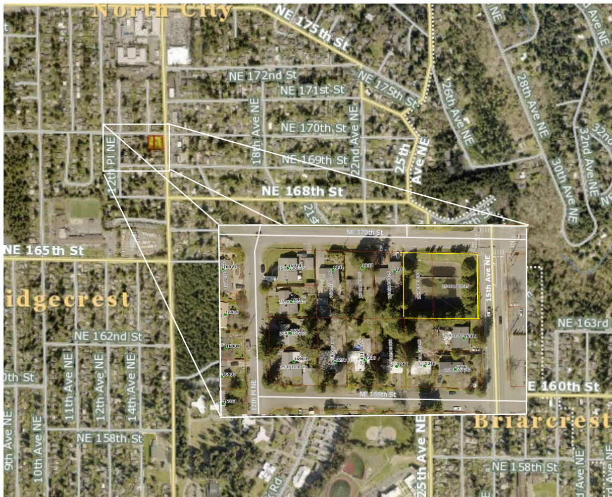
Figure 1. Vicinity map showing study area (parcel boundary highlighted in yellow).

The study area includes the subject parcels and adjacent vegetation which may be affected by the proposed project. The subject properties total approximately 21,666 square feet in size (according to King County Assessor) and are currently the site of a stormwater retention pond. Single-family residential parcels border the subject property to the south and west. See Figure 1 for a map of the study area and site vicinity.