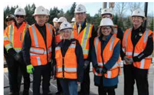
Senator Patty Murray visit

Project information: engage.shorelinewa.gov/145corridor