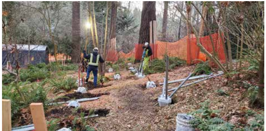
Installing diamond pier foundations for the walkway coming to Kruckeberg Botanic Garden

The second bundle of sites (James Keough, Richmond Highlands, and Brugger's Bog Parks) are still in various stages of permitting. Construction