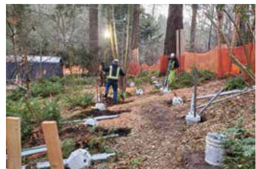
Park Bond project updates