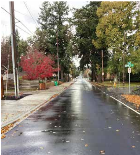
New sidewalk on 20 th Avenue NW from NW 190 th to NW 195 th Streets helps pedestrians get safely to Richmond Beach Saltwater Park.

MORE INFORMATION shorelinewa.gov/parkbond