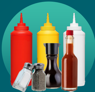
Condiment & Sauce Containers