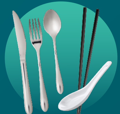
Forks, Knives, Spoons & Chopsticks