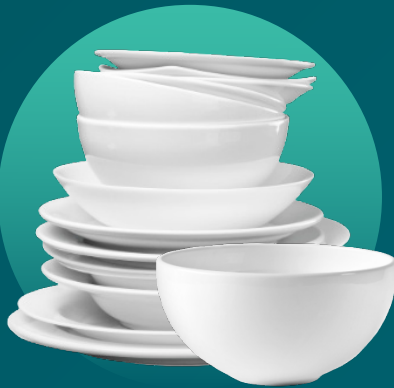
Plates & Bowls