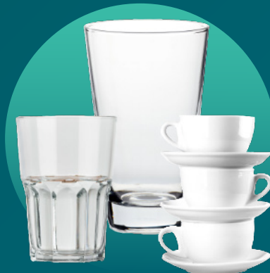
Glasses, Cups & Mugs