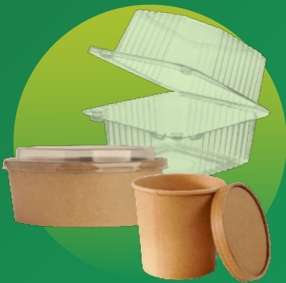
Clamshells & Bowls