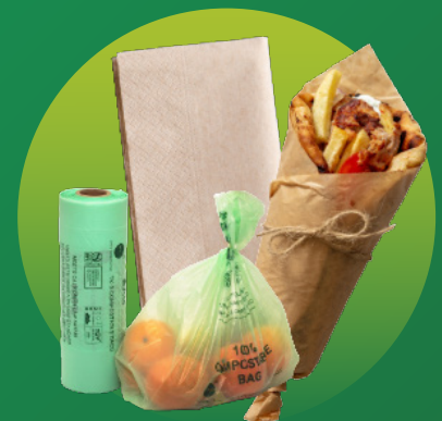
Napkins, Produce Bags & Food Contact Paper