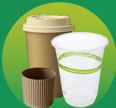
Hot/Cold Cups, Lids & Cup Sleeves