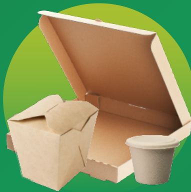
Boxes & Portion Cups