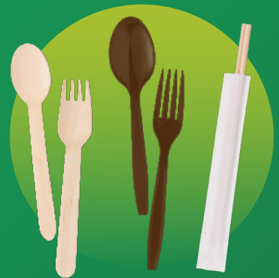
Forks, Knives, Spoons & Chopsticks