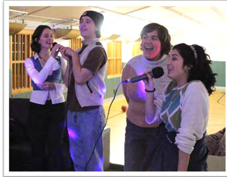
YOLO Karaoke Night