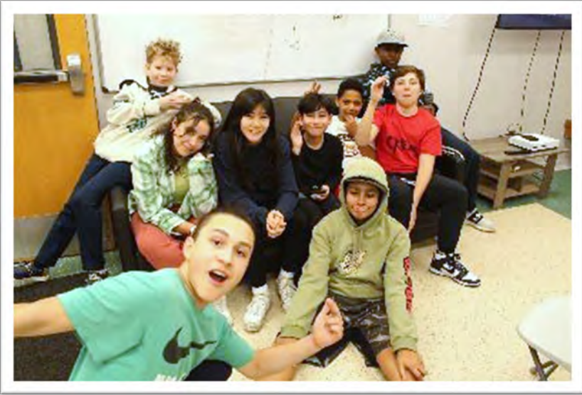
December Middle School Night