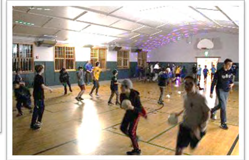
January Ice Castle Dodgeball

RECREATION AND CULTURAL SERVICES UPDATES