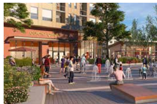
Economic Development update