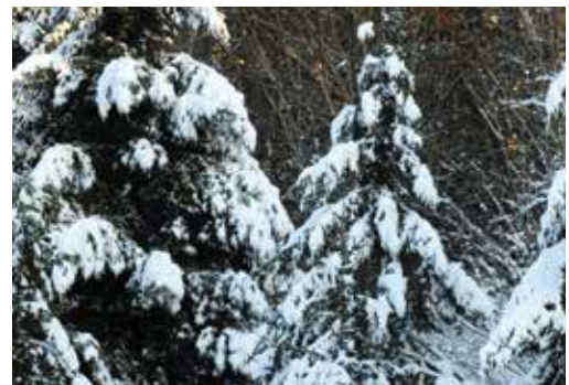
Prepare for winter weather