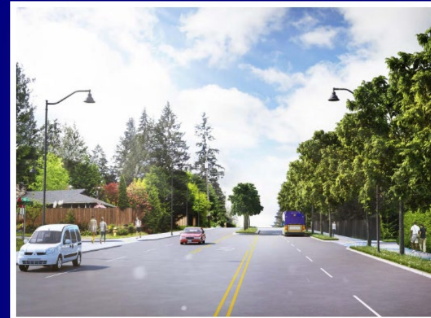
Future design of 145th Street near Sunnyside Avenue