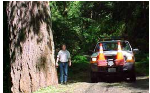
CECRT Annual Report