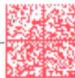
EXHIBIT 9 US POSTAGE TM PITNEY BOWES