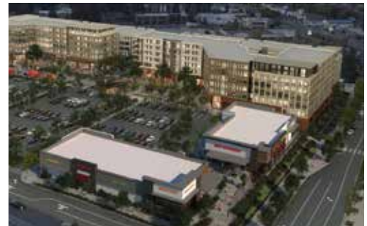
Economic Development update Page 4