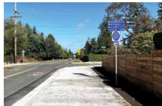
New sidewalk construction Page 6