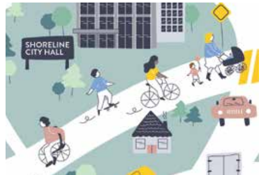
Transportation Master Plan Update Page 5