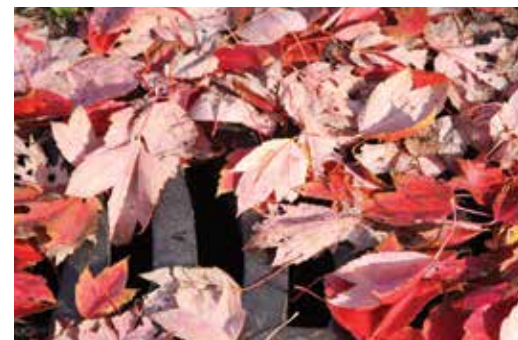
Adopt-A-Drain volunteers needed