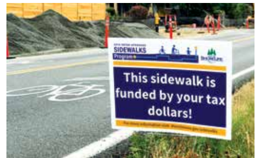
Capital improvement update