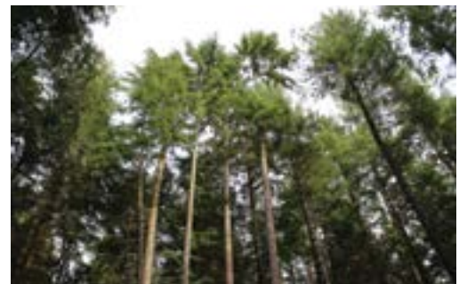
Proposition 1 Update