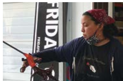
Celebrate Indigenous Art