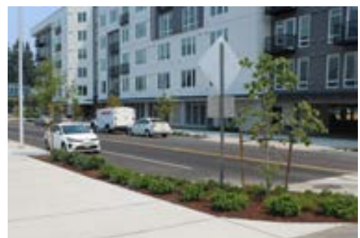
Shoreline Place Update