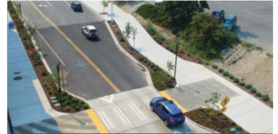
Now Open: Westminster Way!

Trammel Crow Residential, developer of "The Current" (the 330-unit apartment building formerly known as the Alexan), began work on the street in 2019 when its contractors removed the old road to construct underground utility upgrades. This was necessary for the hundreds of new residents who will live at The Current following the building's completion, expected later this year. Once the utility work was complete, the road was rebuilt to the specifications developed by the City with input from the community over the course of several years. The project includes a new 157 th Street and a one-way (eastbound) connection from Westminster Way to Aurora Avenue.