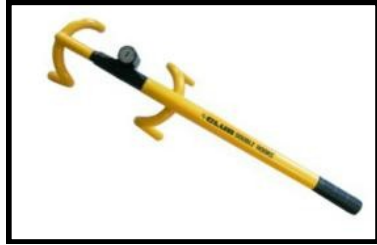
STEERING WHEEL LOCK "CLUB" TWIN HOOKS

The Steering Wheel Lock, or "Club", fits cars, trucks and SUV's. They are available at both Storefront offices: