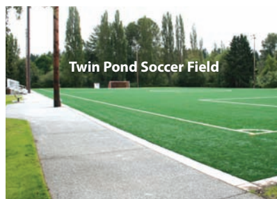
Twin Pond Soccer Field

Twin Ponds Soccer Field upgrades – In July the City dedicated the upgrade of Twin Ponds Soccer Field to synthetic turf.