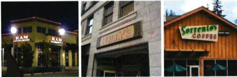
Individual backlit letters (left image), opaque signs where only the light shines through the copy (center image), and neon signs (right image).