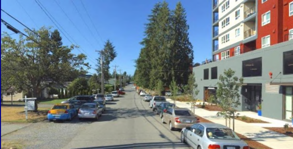
12 th Avenue NE near Polaris Apartments