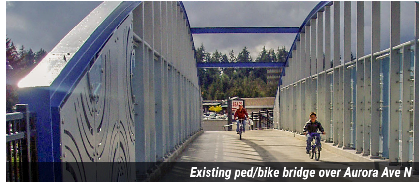
Existing ped/bike bridge over Aurora Ave N