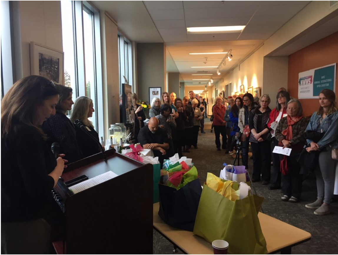
Opening Night Prize Announcements