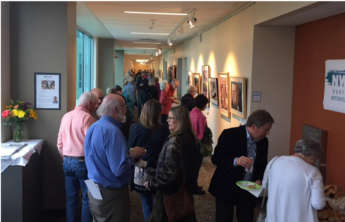
Opening Night, May 2 nd 2019