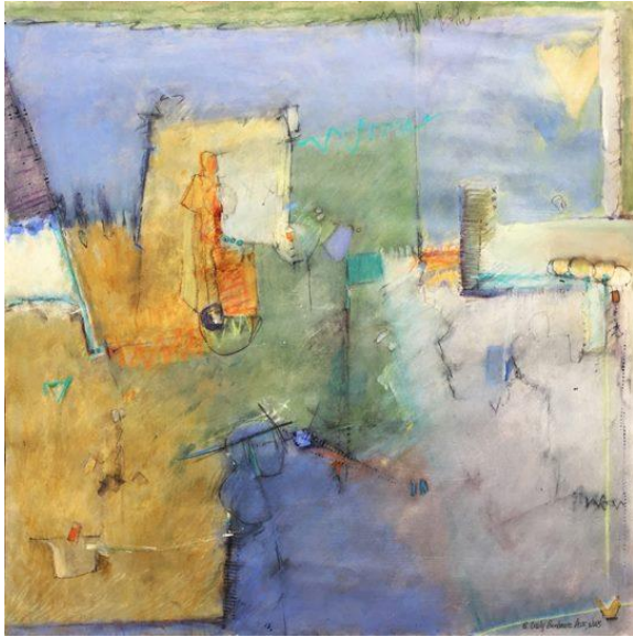
Elaine Dalily-Birnbaum's "Let the Souls Wander" 2018