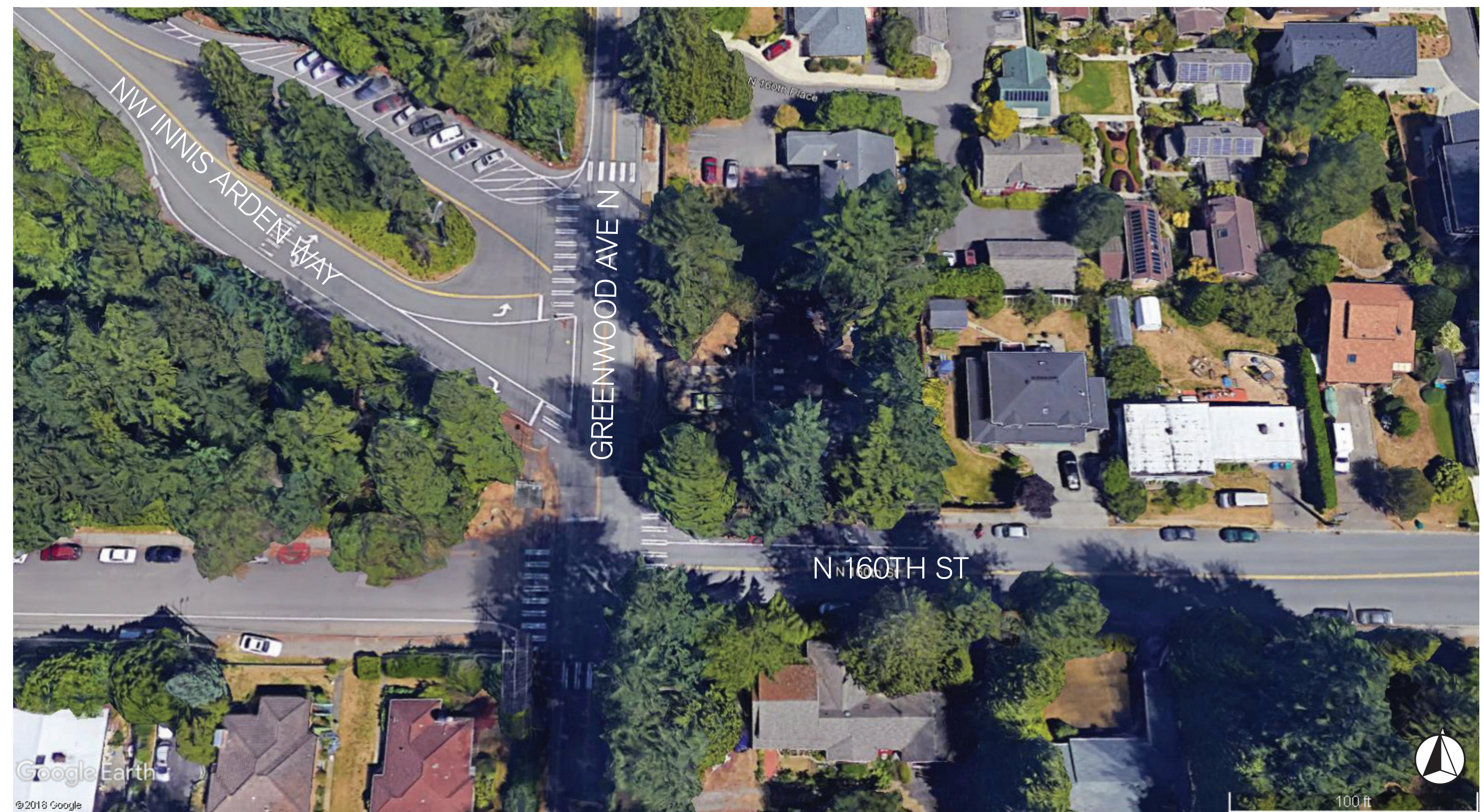
Existing conditions at the intersection of Greenwood Avenue N with N 160th Street and NW Innis Arden Way.

At tonight's open house you can learn more about the conceptual options and provide input to help inform the preferred concept design.