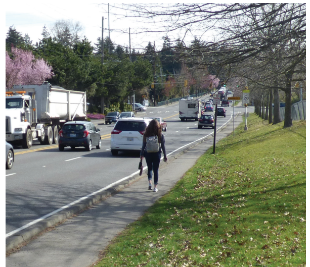
175th Street is one of Shoreline’s busiest east-west arterials.

Before we began thinking about a project on the 175th Street corridor, our team was studying traffic patterns, reviewing safety requirements, and looking at how to make all our traffic corridors more accessible for people walking, biking, driving, and taking transit. Input from residents for other projects in the area has helped inform the City’s priorities and contributed to identifying 175th Street as a priority project in the Transportation Master Plan in 2011. This project meets many of our transportation goals identified in the Comprehensive Plan Transportation Element in 2012 and the Complete Streets Policy, including allowing for more transit, bike, and pedestrian options.