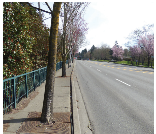
Parts of 175th Street cannot accommodate all users, such as those using strollers and wheelchairs.