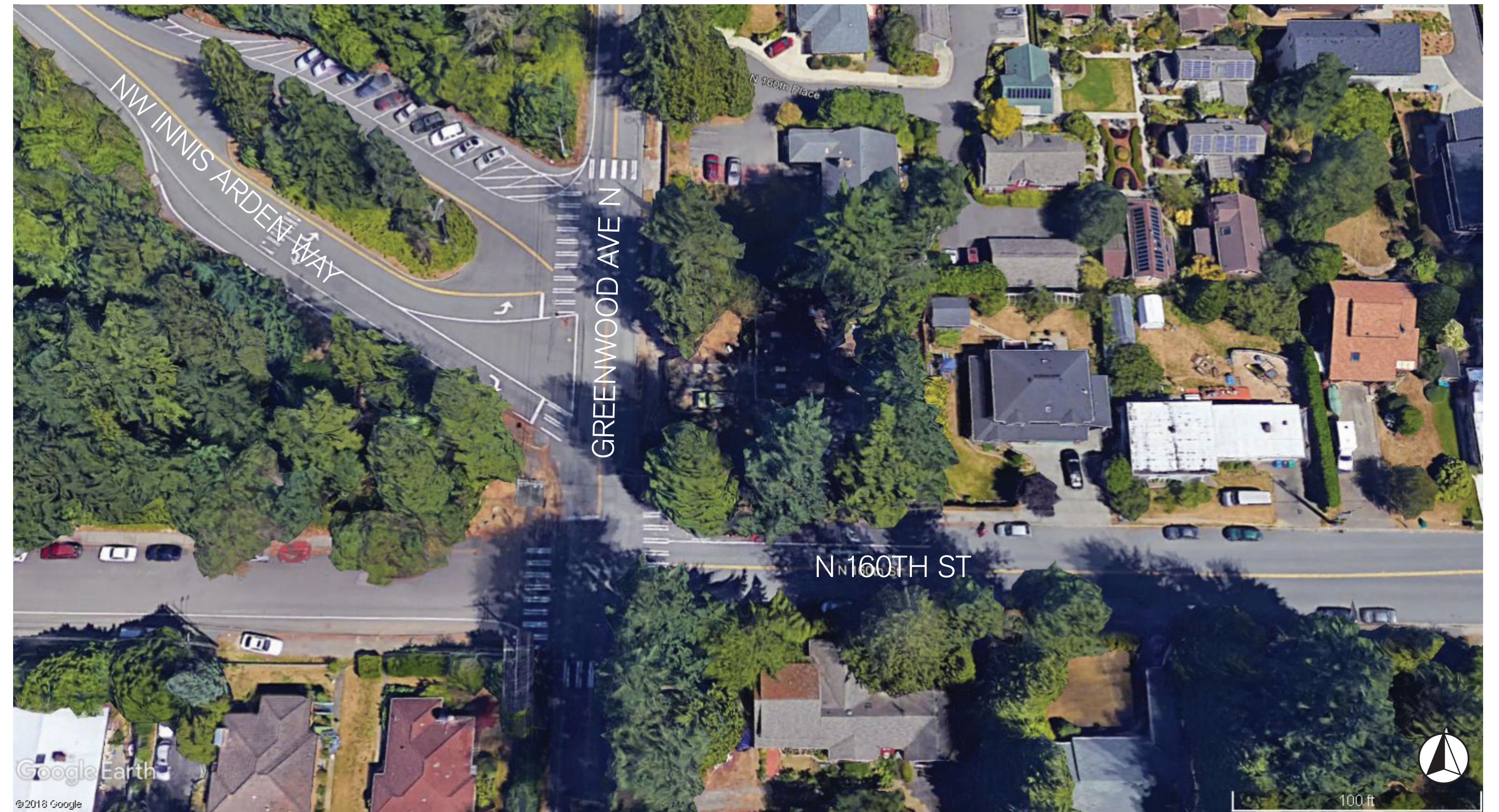
Existing conditions at the intersection of Greenwood Avenue N with N 160th Street and NW Innis Arden Way.

At tonight's open house you can learn more about the conceptual options and provide input to help inform the alternatives.