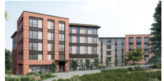
Spring 2019—Construction Impacts

Improving safety, access, and mobility on Greenwood Ave N, N 160th St, and NW Innis Arden Way