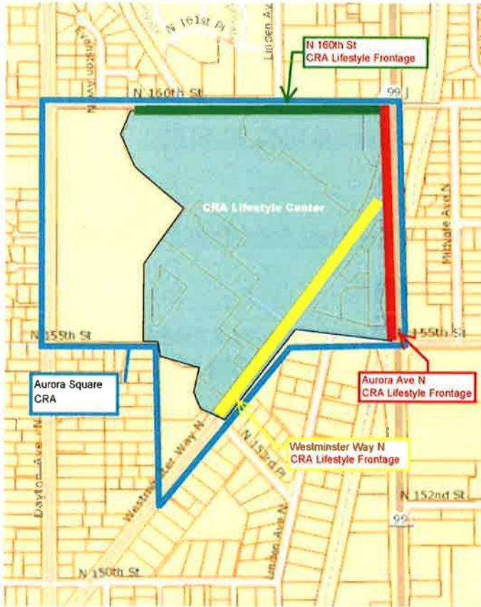
Map 20.50.620.B—Aurora Square CRA