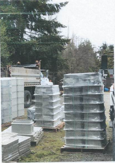
Carry Down and Offload

From: [redacted]@gmail.com Subject: [redacted] Date: [redacted] To: [redacted]@gmail.com