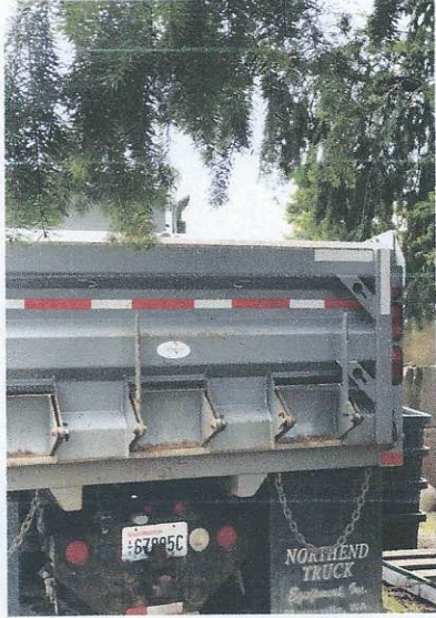
Carry Down and Offload

Date: [redacted]@gmail.com Subject: [redacted] Date: [redacted] To: [redacted]@gmail.com