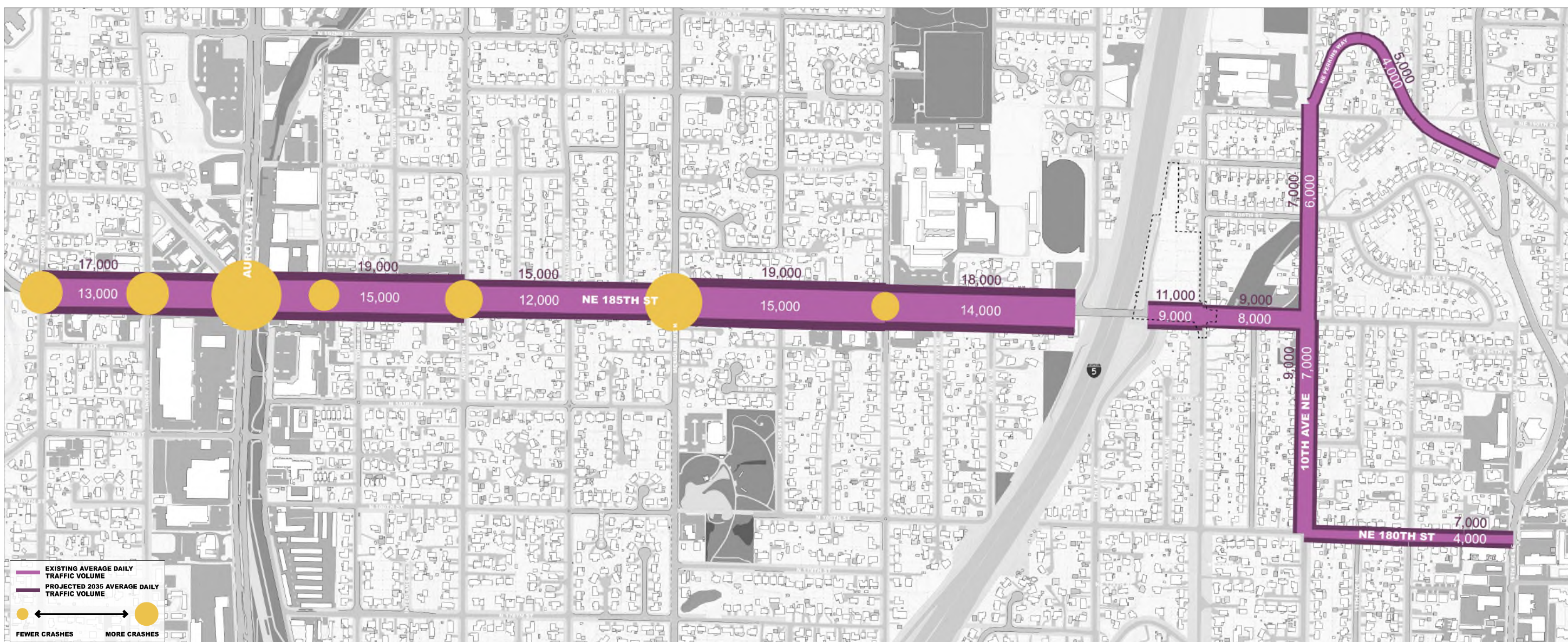
Collisions by Location and Type (2014-2017)