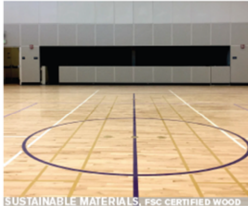
SUSTAINABLE MATERIALS, FSC CERTIFIED WOOD