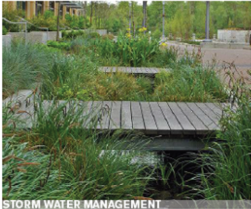
STORM WATER MANAGEMENT