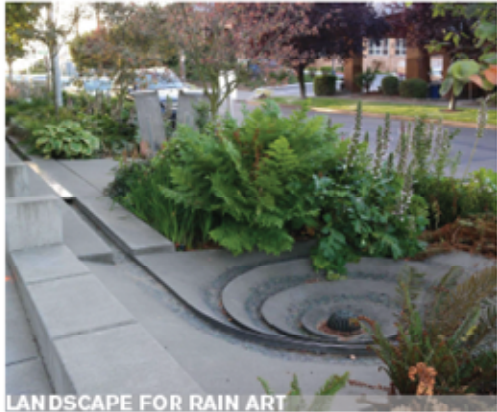
LANDSCAPE FOR RAIN ART