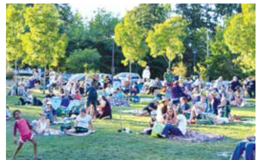
Summer events calendar