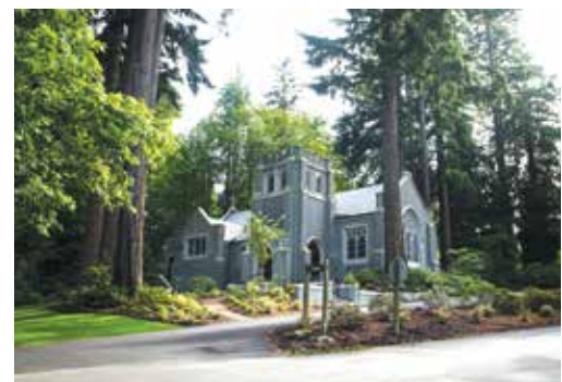
Neighborhood spotlight: Highlands Page 4