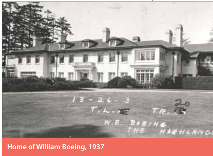
Home of William Boeing, 1937