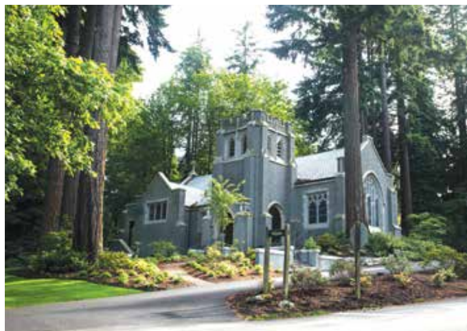
Florence Henry Memorial Chapel