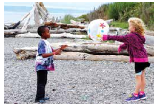
PROS Plan update