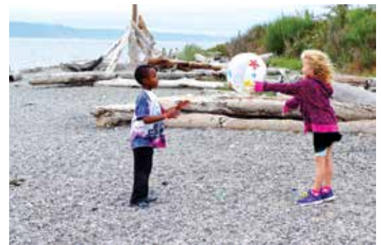
Camp Shoreline participants at Richmond Beach Saltwater Park

We want the Draft Plan to reflect what you have shared with us. You can view the Draft Plan at shorelinewa.gov/prosplan . If you would like to make a comment on the Draft Plan, you can do so online or at the Council meetings on June 12, July 17, or July 31. To learn more about how to provide public comment, please visit shorelinewa.gov/councilmeetings .