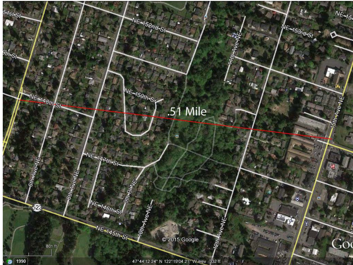
Fircrest Campus Near Proposed Rail Station NE 145th