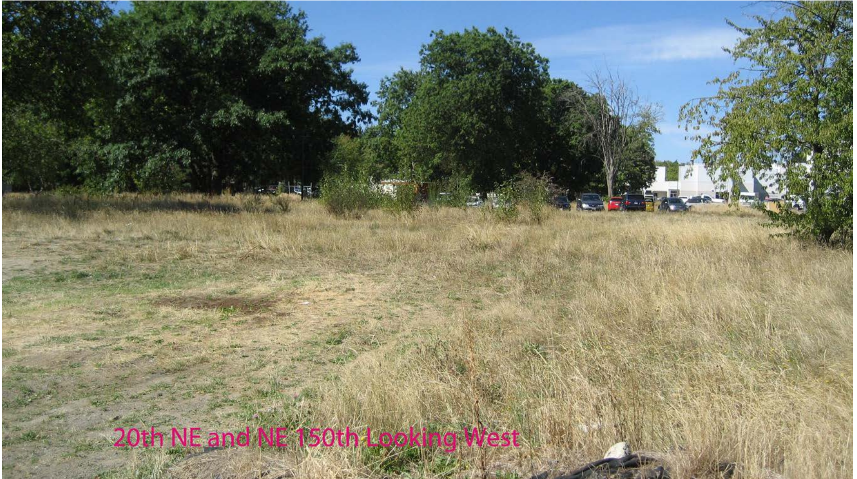
20th NE and NE 150th Looking West