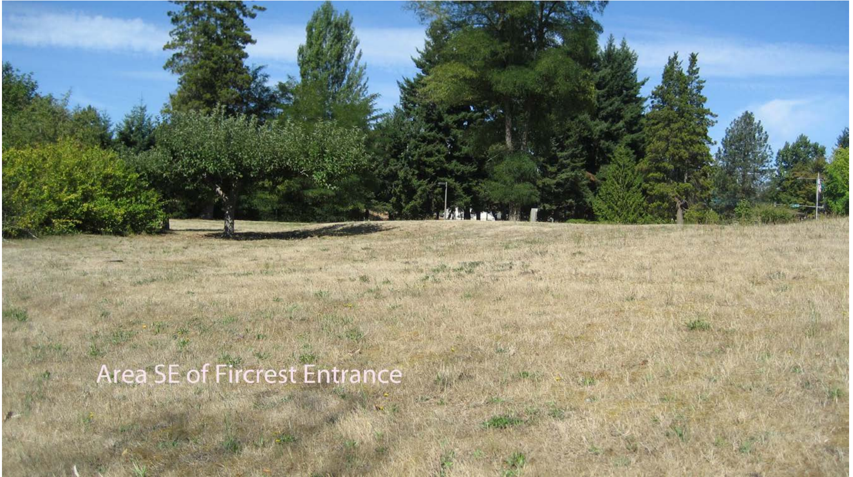
Area SE of Fircrest Entrance