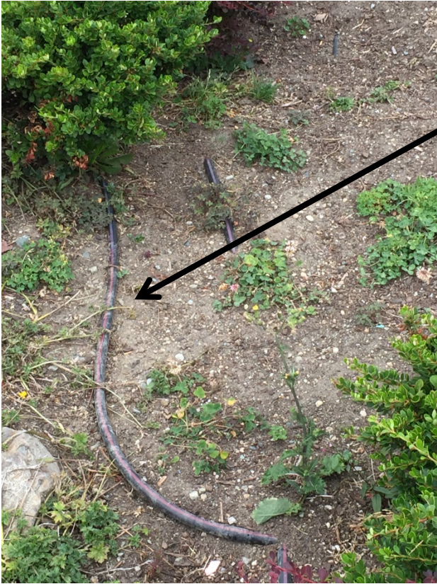
Photo 3 Example of drip line irrigation for corridor landscaping for corridor landscape watering.

Example of Drip line and pop-up irrigation systems.