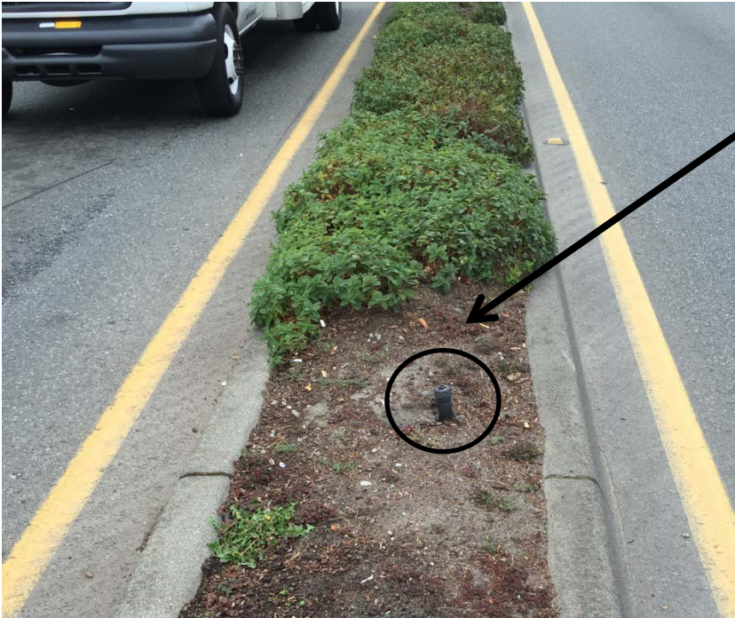
Photo 4 Example of pop-up sprinkler for corridor landscape watering.