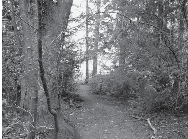
The bond will allow the City to purchase and preserve urban forest like the Seattle Public Utilities property above, make park improvements and improve trails throughout Shoreline’s parks system.

The third property acquisition financed by the bond is for the Kruckeberg Botanic Garden on 15 th Avenue NW. This property is home to the plant collection of Dr.