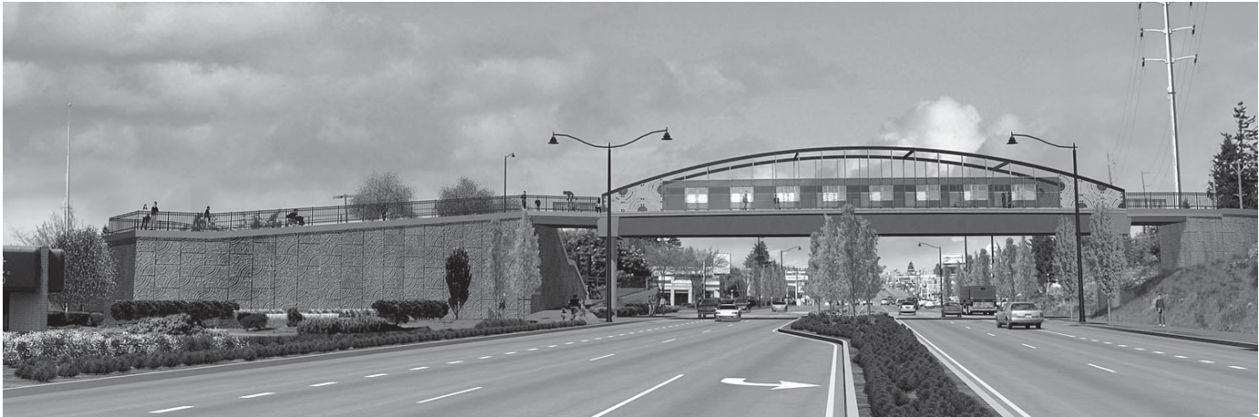
Above is an illustration of the Aurora Bridge, looking north from about N. 155th Street.