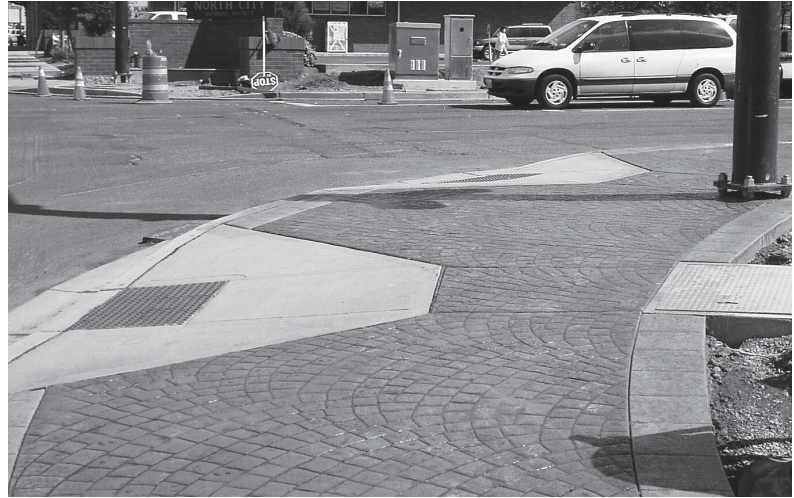
The decorative concrete work at the corner of the intersections is being poured for the North City Project.

The tree grates are already in place, protecting the deep holes waiting for the trees. The two species of trees featured along 15 th Avenue NE – Autumn Applause Ash and Chanticleer Pear – were selected because they are both narrow-growing trees with spectacular fall color. The pear also has white flowers in spring.