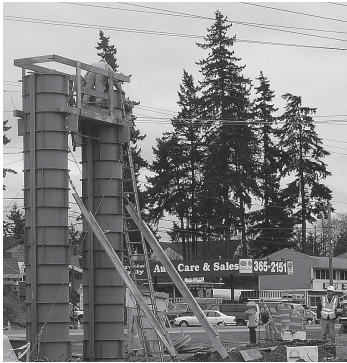
Pouring the concrete columns for the Aurora Interurban Trail Bridge.

The City of Shoreline allocated $42.2 million for Capital Improvement Program (CIP) projects this year. These projects are part of the 2006-2011 CIP totaling $168.3 million.