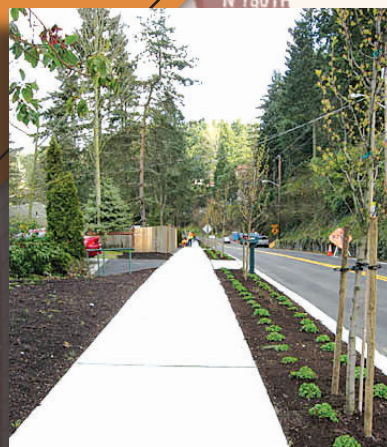
Above: New sidewalk along Dayton. Below: Crews begin work on the new traffic signal on 15th Avenue NE at NE 150th Street.

• The Dayton Retaining Wall was completed at the end of March after significant delays during pile installation and wall construction. Crews will install handrails on top of the wall in May. The roadway in front of the wall will receive new asphalt pavement later this year.