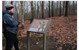
Environmental interpretation and education