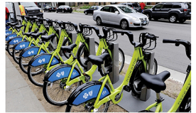
Bike stations and bike share programs