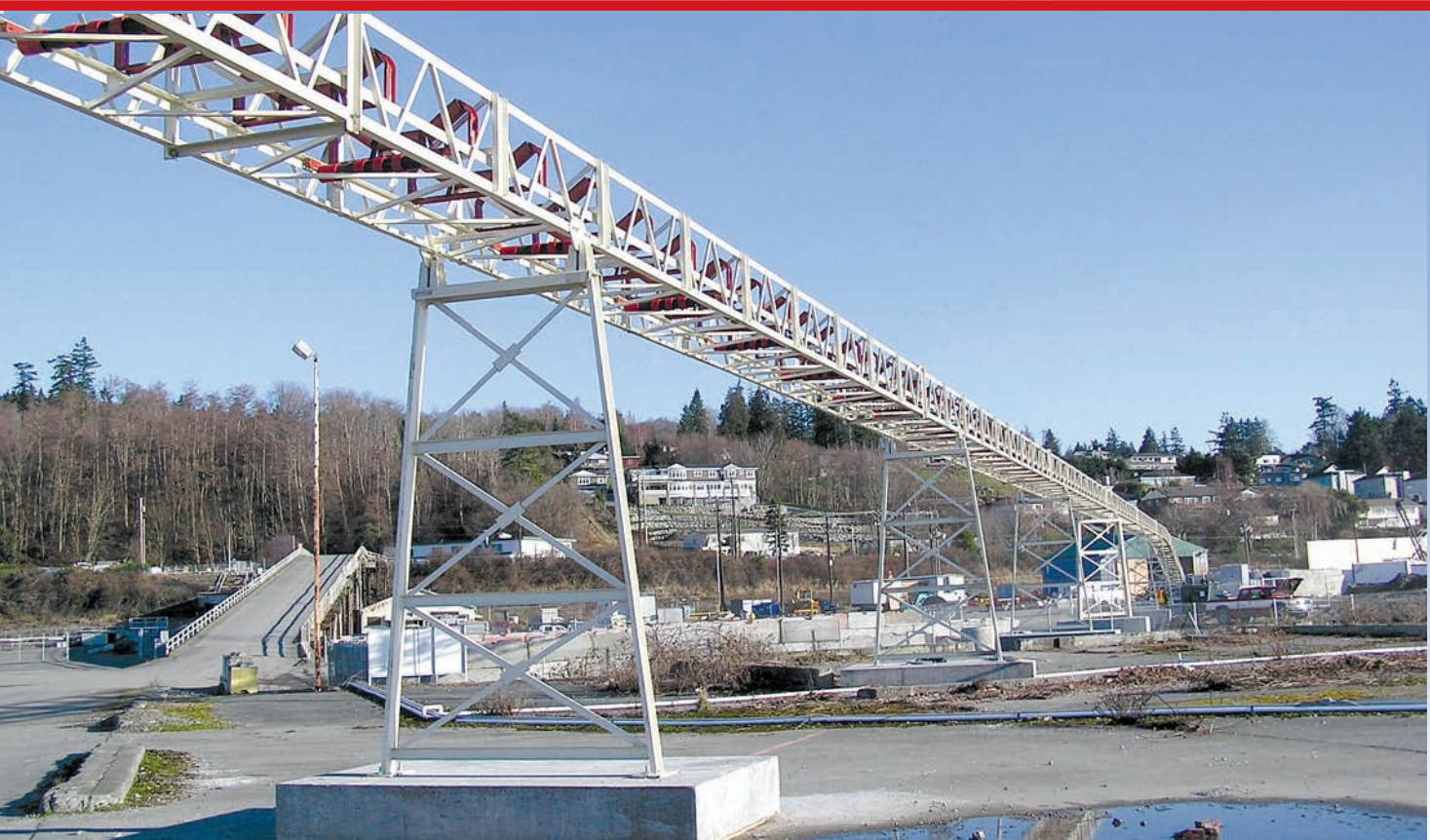
Crews use a conveyor system to transport tunneling spoils from the Point Wells portal to a docked barge.