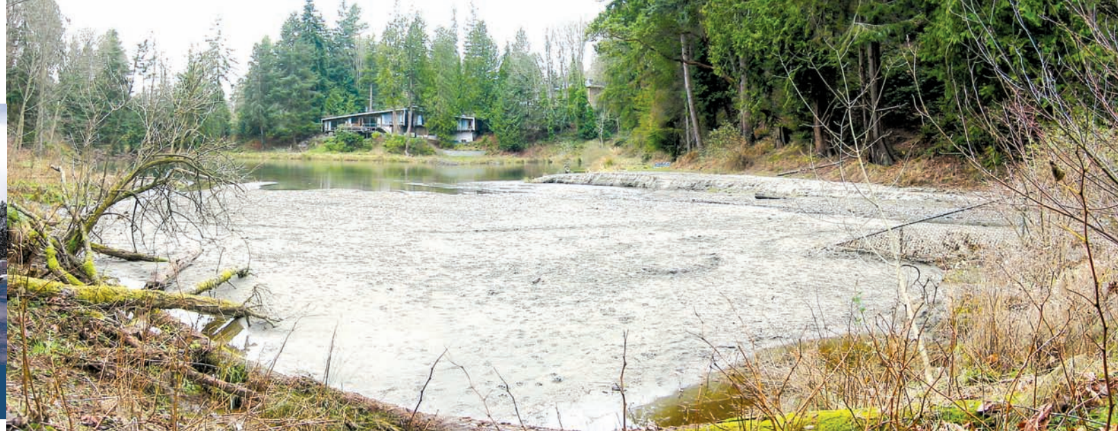
The foreground of this photo taken December 14 of Hidden Lake looking southwest shows the sand washed into the sediment forebay from the December 3 storm.