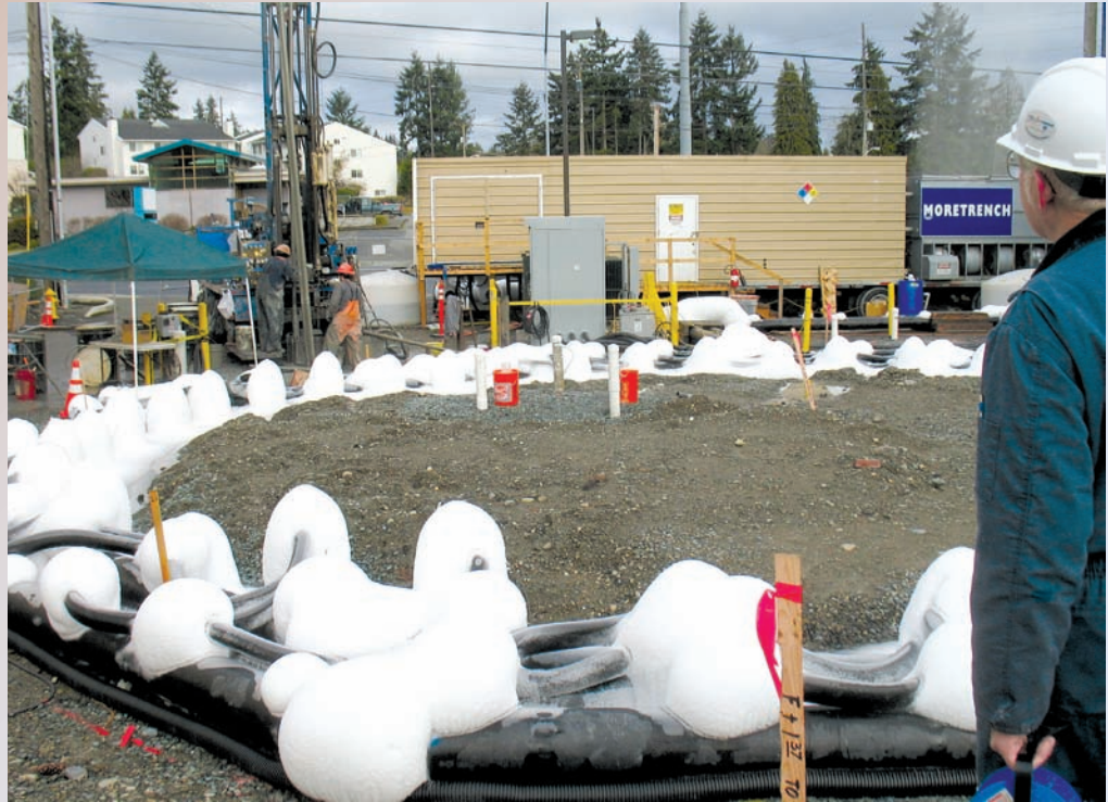
The Ballinger Way portal construction is using ground freezing for excavating the deep construction shaft. The frozen ground acts as a temporary support as the portal is being excavated. After excavation is complete a concrete liner is built.

As of January 2008, crews have installed almost 11,000 feet of new sewer pipe in the County's system, 900 feet of local sewer and 5,500 feet of water line for Seattle Public Utilities. Crews are now working in Innis Arden, where construction and street restoration are expected to be completed by fall 2008.