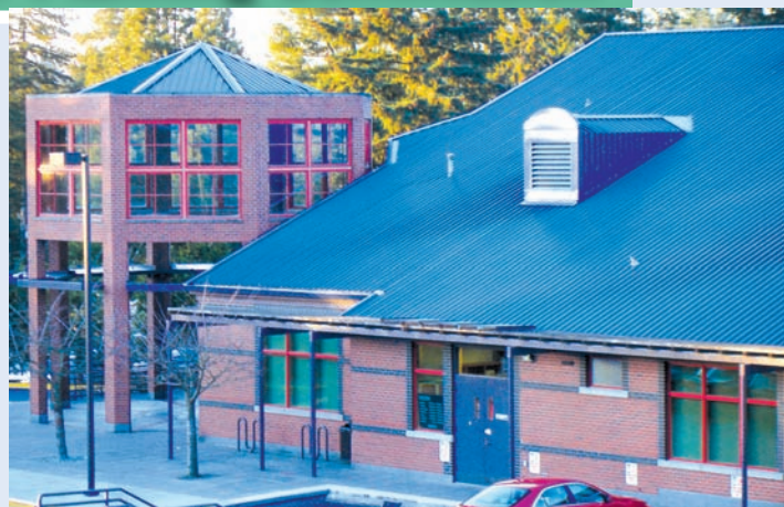
Shoreline Library, 345 NE 175th Street

The Library Board has five members and meets at 7:00 p.m. the second Thursday of each odd numbered month. The meetings are held alternately at the Shoreline Library and the Richmond Beach Library.