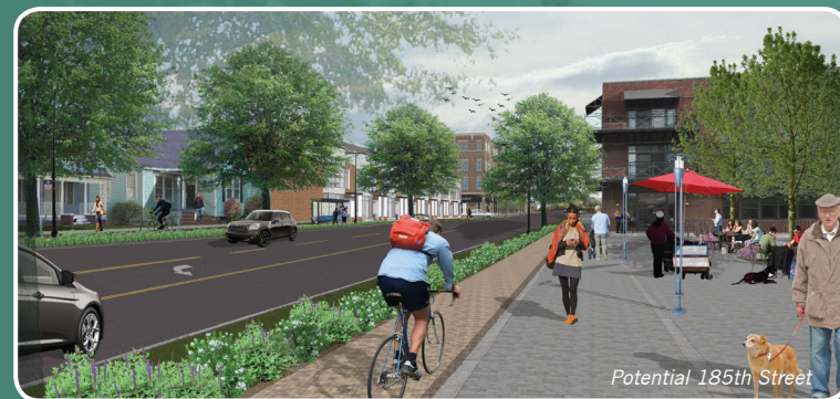
Potential 185th Street

June 3, 2014: Community Meeting Shoreline City Hall