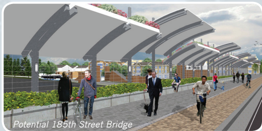
Potential 185th Street Bridge

The EIS examines potential impacts of long-term growth in neighborhoods surrounding light rail. Please join us to learn about this analysis, the scenarios and topics it studied, possible improvements to roads and other infrastructure, how to comment, and next steps in the process. Questions welcomed. Refreshments and child care will be provided.