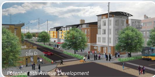
Potential 8th Avenue Development

These images were based on community input, presented at the February Design Workshops, and portray possibilities of how the subarea may change over time.