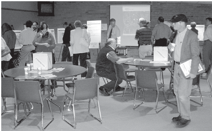
Shoreline residents learned more about and gave comments on the Draft Master Plans/Comp Plan Update at a May 13 Open House. Once the comment period ends, the Planning Commission will hold workshops and public hearings to get more community feedback before the plans are finalized.