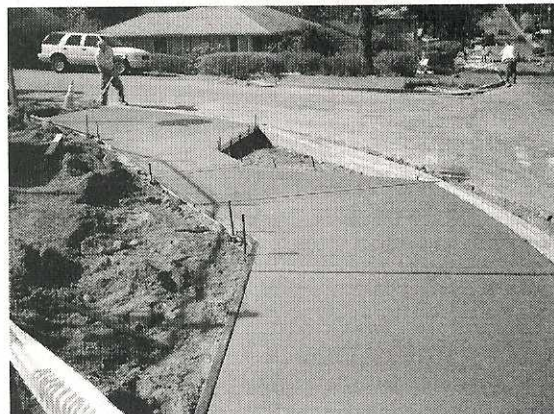
The Serpentine Drainage Improvement Project included new sidewalks, curb and gutter along NE 175th St. as well as installation of storm drainage pipe and a new pump station.