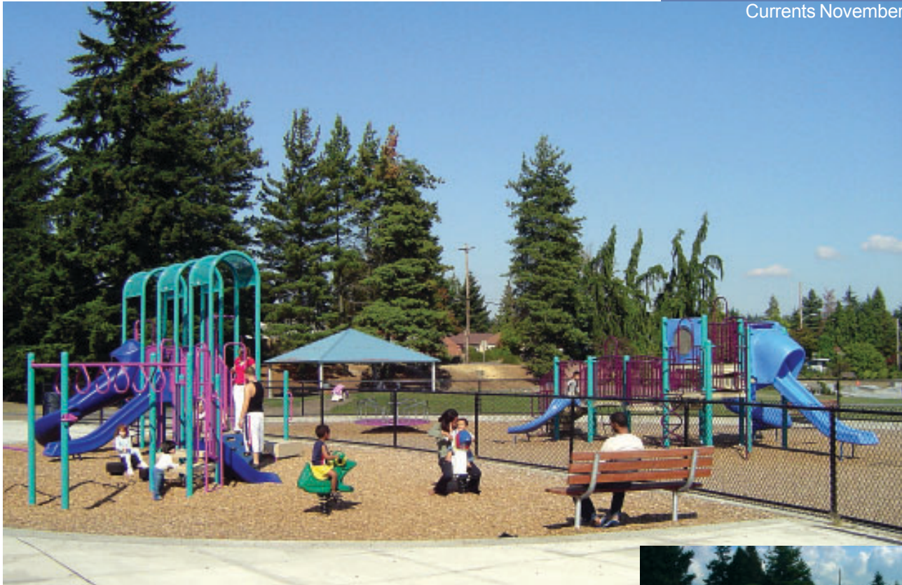
Paramount Park was renovated in 2002 to include new ball fields, walking path and skate park. New playground equipment and a picnic shelter were added this year.