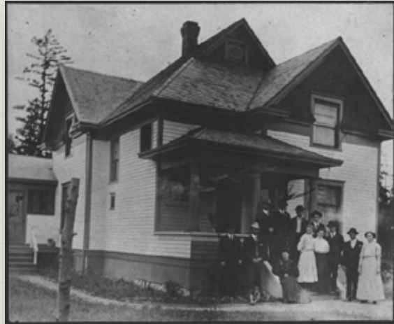
Fish Family Residence/ Queen City Poultry Ranch, now the Purdy/Strand house, 15747 - Greenwood Ave. N., built in 1903