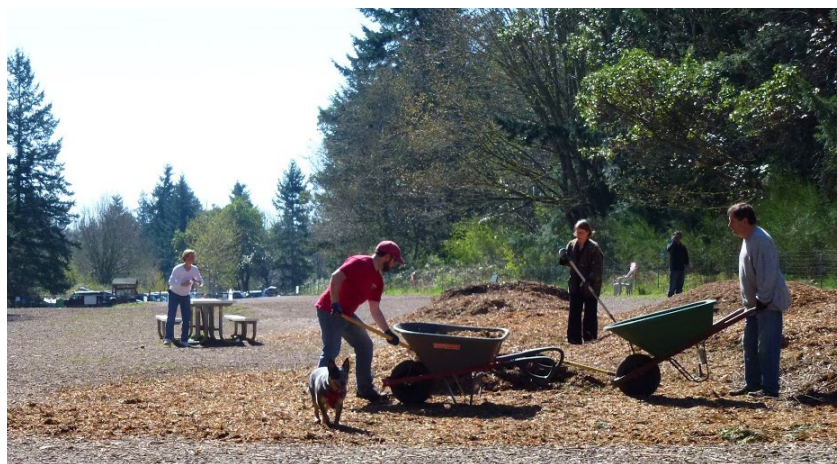
ShoreDog volunteers work to improve the Shoreview Off-Leash Area