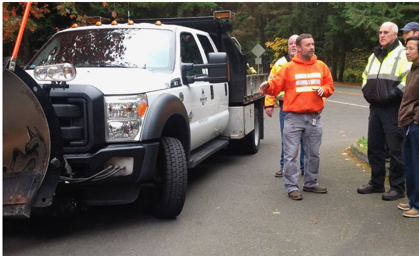
City staff prepared for the storm season by attending Snow School, reviewing plow, sanding, and de-icer techniques and routes.

Check the City's website and Facebook pages for information about facility and road closures and progress updates on snow plowing.