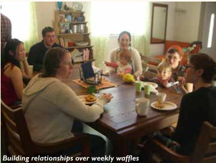
Building relationships over weekly waffles

To learn more about the City's Neighborhoods Program and find contact information for your neighborhood association, visit the City's website at shorelinewa.gov/neighborhoods .