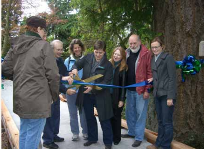
Cutting the ribbon on entry improvements at Kruckeberg Botanic Garden

To learn more about the Garden and to plan a visit, go to kruckeberg.org .