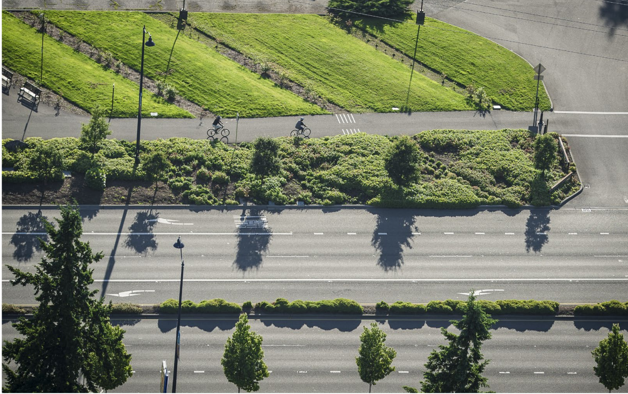
Aurora Avenue N and Interurban Trail