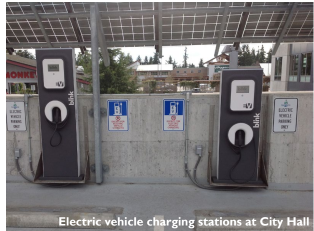
Electric vehicle charging stations at City Hall

The City has installed two Blink electric vehicle charging stations on the top floor of the City Hall parking garage. The City contracts with ECOtality, Inc., which specializes in alternative fuel, hybrid and electric vehicle infrastructure, to manage the new charging stations. These stations are identified as Level 2 (240 volt AC input) stations, which can fully charge an empty vehicle in approximately eight hours. Customers may be charged a Blink membership fee depending on the option selected. To learn more about using the Blink system visit blinknetwork.com/membership . You can also contact Fleet Supervisor Phil Ramon at pramon@shorelinewa.gov or (206) 801-2411.