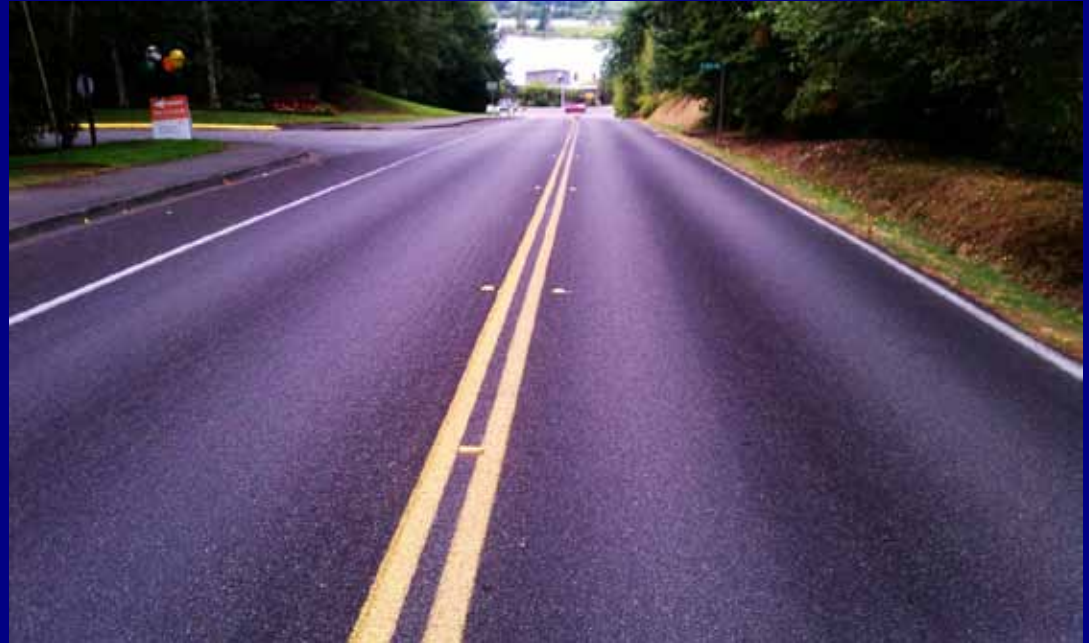
1 st Ave NE