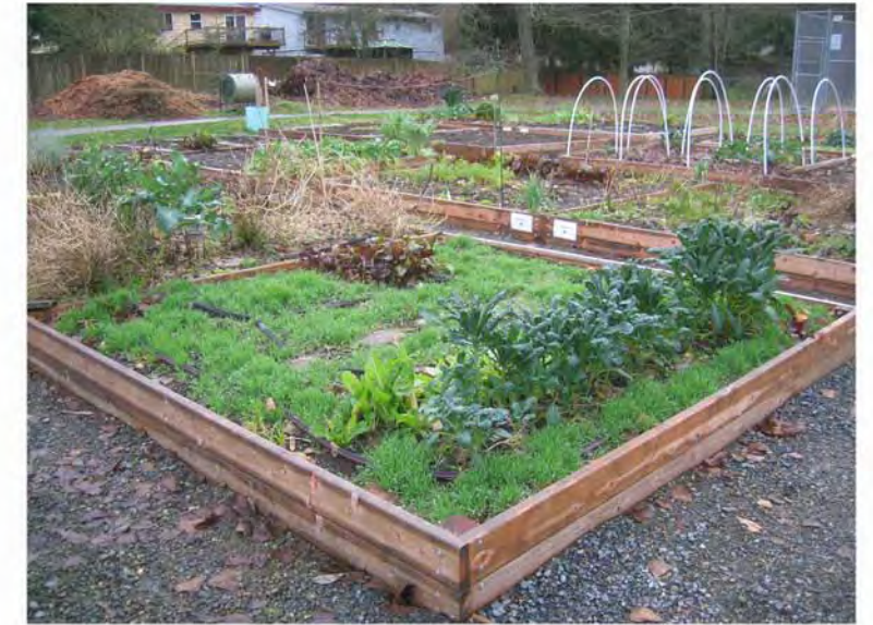
Shoreline Community P-Patch