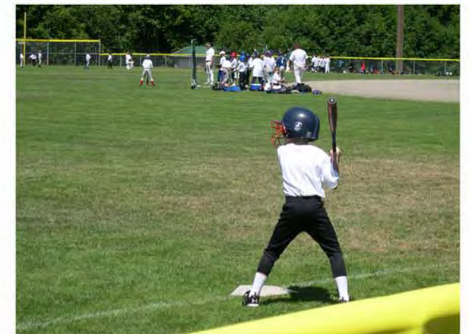
Petrovitsky Park Baseball Field, Renton