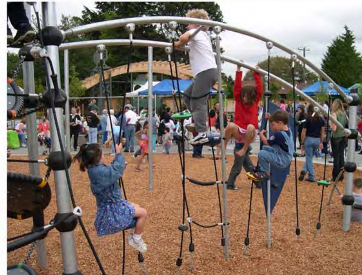
Greenwood Park, Seattle

Reasoning: Seating, age-appropriate play.