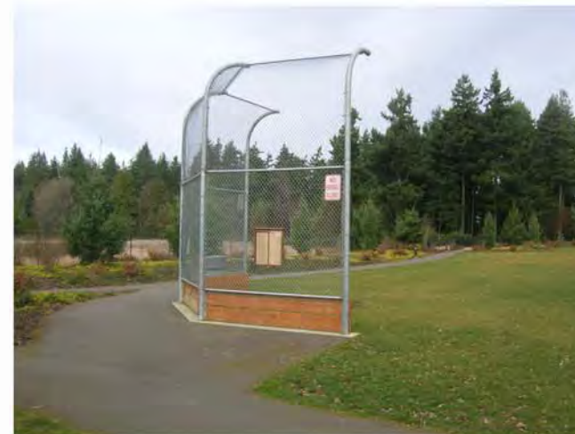
Hickman Park, Edmonds

Items Included: New Backstop ($10,000) Sand leveling + Seeding ($12,000) 3-Row Bleachers ($5,000)