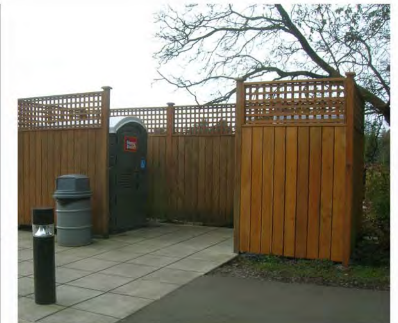
Hickman Park, Edmonds- Restroom Enclosure