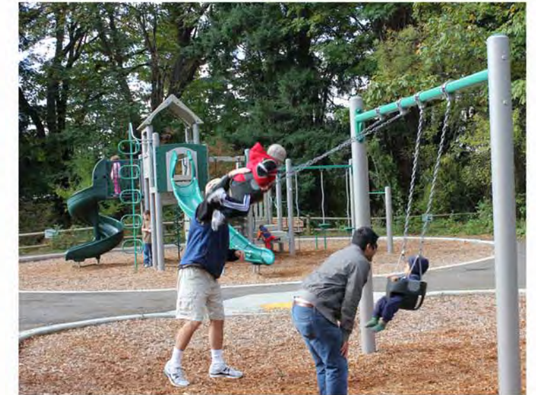
Rose Hill Meadows Park, Kirkland