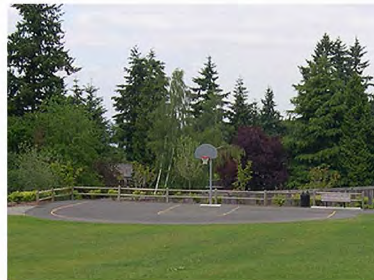
Lattawood Park Basketball Court, Bellevue

Reasoning: Reusing existing paved area and available space constraints.