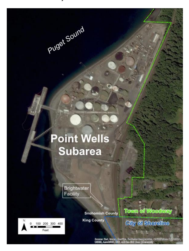
Figure 1. Point Wells Subarea

The Point Wells Subarea is an unincorporated area of approximately 61 acres in the southwestern most corner of Snohomish County. It is bordered on the west by Puget Sound, on the east by the Town of Woodway, and on the south by the Town of Woodway and the City of Shoreline (see Figure 1). Point Wells is not contiguous with any other portion of unincorporated Snohomish County.