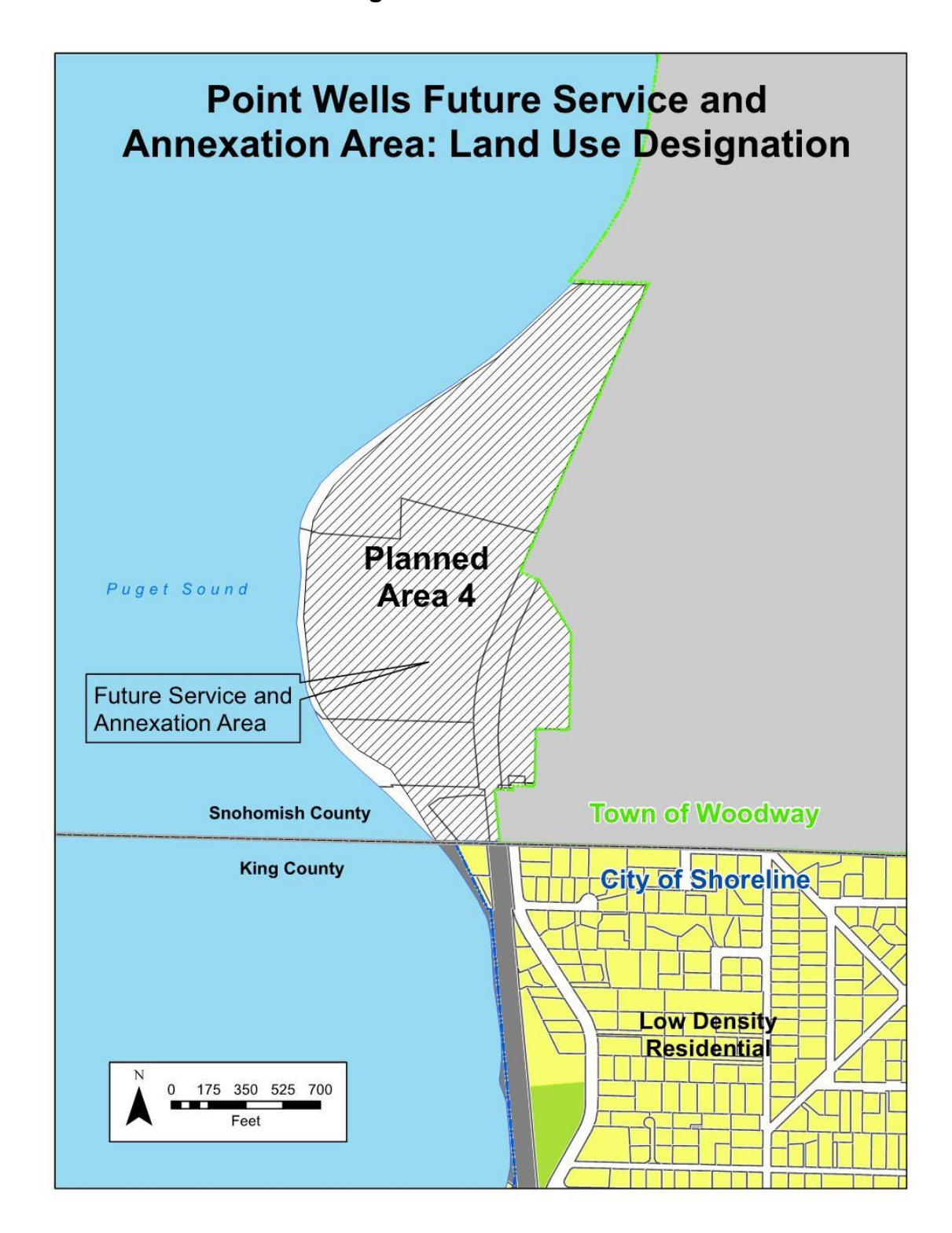
Figure 2 – Land Use Designation