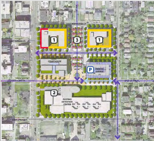
Original Project on Nov 2010 Ballot