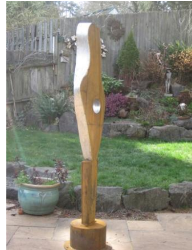
Rodger Squirrell Torso

The three below may be placed in the Kruckeberg Botanic Garden.