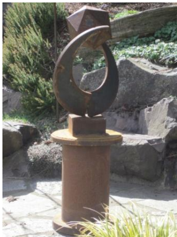
Rodger Squirrell The Pincher

The three below may be placed in the Kruckeberg Botanic Garden.