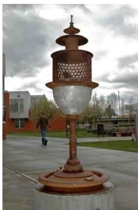
Thor Myhre Zen Beacon (alternate)