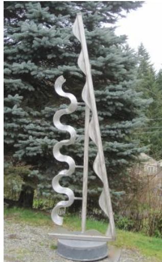
Rodger Squirrell Sail