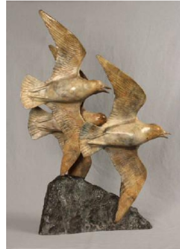
Tony Angell Surf Birds (includes a 2 nd piece)