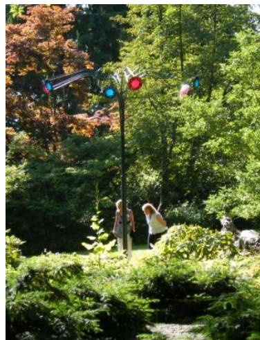
Jeff Tangen Celebration