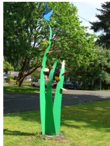
Leon White Miracle Grow with Bluebird